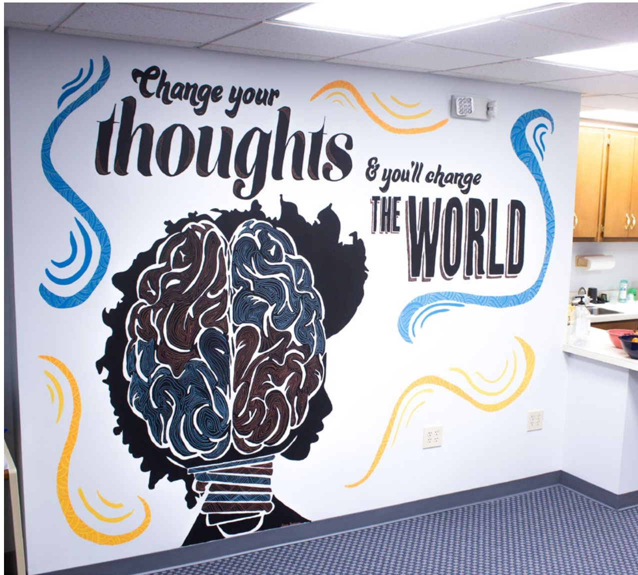
Change The World (2019), 10' x 9' Office in Stone Mountain, GA