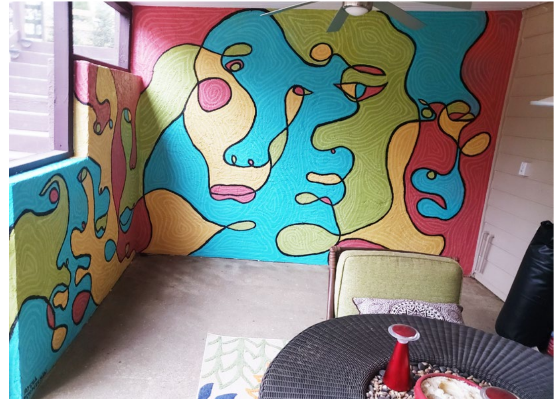
Ceata's Patio (2021), 7.5' - 11.5' X 6' - 8.25' Powder Springs, GA