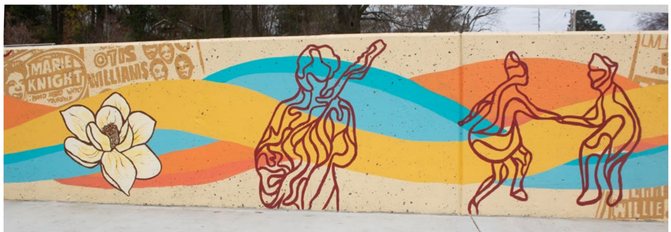
Rhythms of Magnolia (2021), 506 SF

Rodney Cook Park (Sports Courts at Southwest Corner of Park)- Vine St NW, Atlanta, GA Commissioned by Trust for Public Land & City of Atlanta Mayor's Office of Cultural Affairs