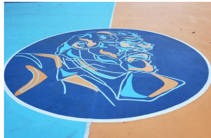
Leaders at Play (2021), 50' x 94' Rev. James Orange Park at Oakland City, 1305 Oakland Ln SW, Atlanta, GA Commissioned by Art in the Paint