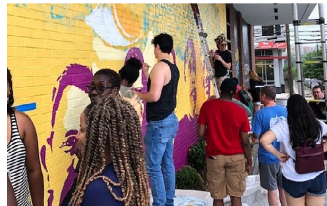
The Soul of Reynoldstown (2021), 35' x 13' 780 Memorial Dr SE, Atlanta, GA Commissioned by AIA's Young Architect Forum