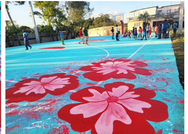
Bayahibe Rose (2021), 50' x 94' Villa Altagracia, Dominican Republic Commissioned by Art in the Paint