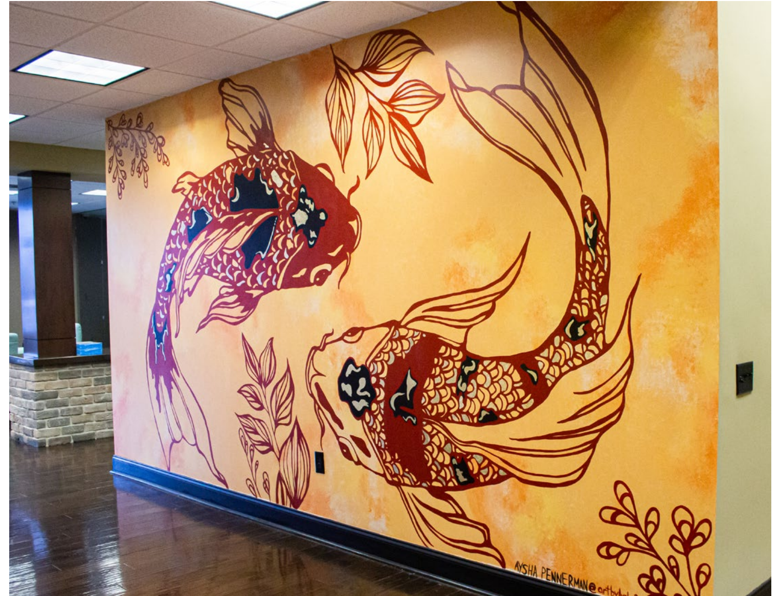
Koi Fish (2020), 15.9' x 8.5' Office in Stone Mountain, GA