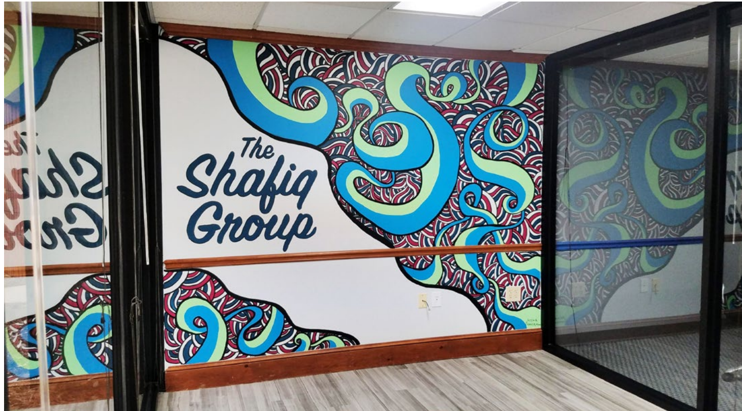
The Shafiq Group Office Mural (2019), 9' x 9' Stone Mountain, GA